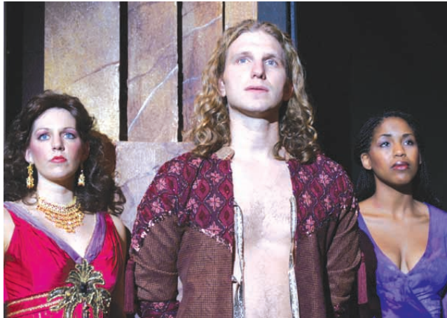
NOW ON STAGE — Amneris Radames and Aida, the three central figures in the Ogunquit Playhouse's presentation of "Aida".

In-season box office hours now through September 10 are Monday through Saturday from 10 a.m. to 8 p.m., Sunday from 12-5 p.m.; window sales only. Tickets are also available online at ogunquitplayhouse.org .