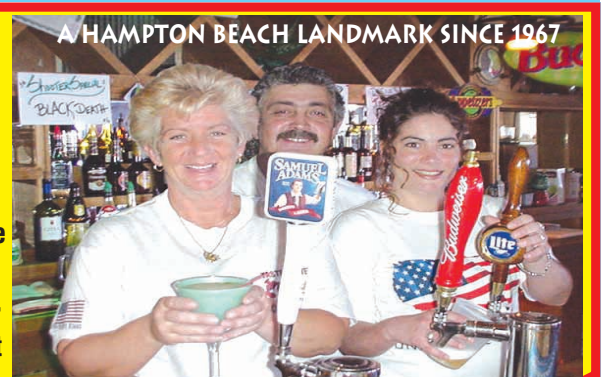
A HAMPTON BEACH LANDMARK SINCE 1967