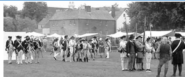
Revolutionary War Encampment at Strawbery Banke

the beautiful Steam Engines of the NH Garden Railway Society chug over bridges, past windmills, and through a miniature village along their landscaped outdoor tracks. Find out more at www.nhgrs.com