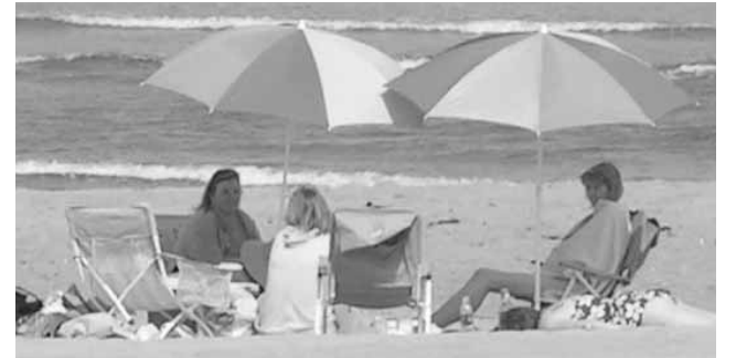
KNOWN FOR THE BEACH — Hampton Beach continues to attract thousands of visitors every year.

For more information about this summer's series of events at Hampton Beach, please turn to Pages 20-21A in this and every edition of the Beach News .