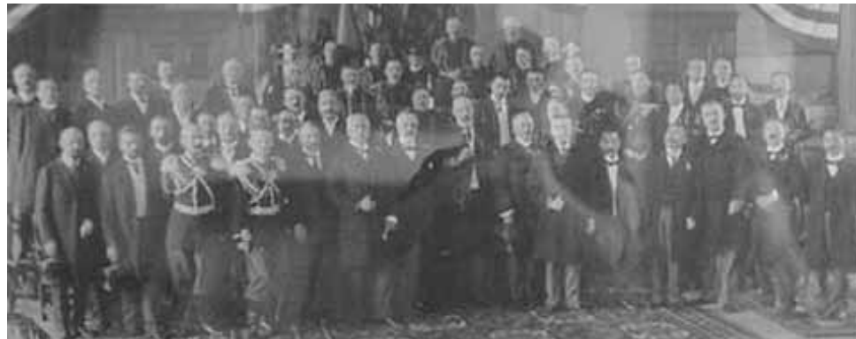
A TALE OF TWO EMPIRES — With Portsmouth and the Shipyard acting as a neutral ground, the assembled representatives of the Empires of Russia and Japan worked out a peace treaty to conclude the Russo-Japanese War.