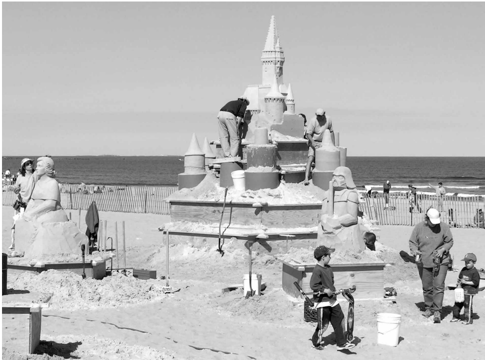
SHAPING UP — Sand sculptors scurry to finish their work on the huge 'demo' project at Hampton Beach on Sunday, June 19. The main competition will take place from Thursday to Saturday. For more images of the demo, please turn to Page 17A.

Sand Sculpting Competition is a free event and is funded in part by sponsors and the Hampton Beach Village District in cooperation with the NH Divisions of Parks, and the Hampton Area Chamber of Commerce.